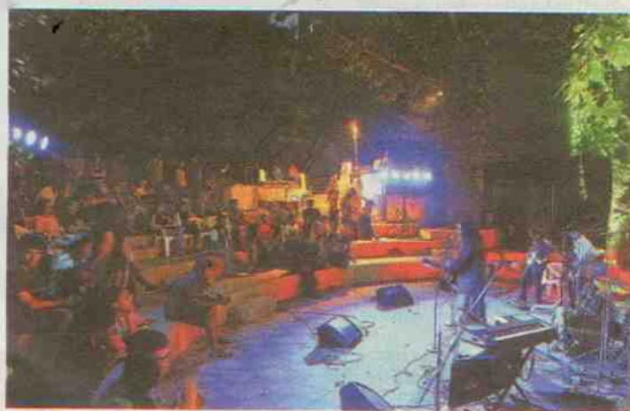
Luminous: The supermoon; and (below) Rang plays at Kamala Nehru Park.

Their alt-rock draws only a small complement of the sort of fans you might find at, say, their Blue Frog gigs. Pensioners on their evening walk drift in; sneaker-shod joggers and child hawkers stop what they are doing. A few people look like they've stopped off before the evening's parties, and there are at least two who could only have trooped in from a day at the bank. "This song is called Bucket of Blood ," D'Mello announces.